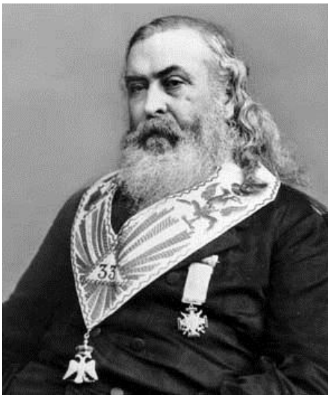
Figure 1: Albert Pike

In the minds of its adherents and the prophecies of Scripture, this will entail a return to the “ days of Noah ” and the “ days of Lot ”, when the Occult ruled the earth. Today it is expressed through the workings of Freemasonry and the related secret societies and international ‘clubs’ controlled by that organization. But it had its beginnings in the deep recesses of history.